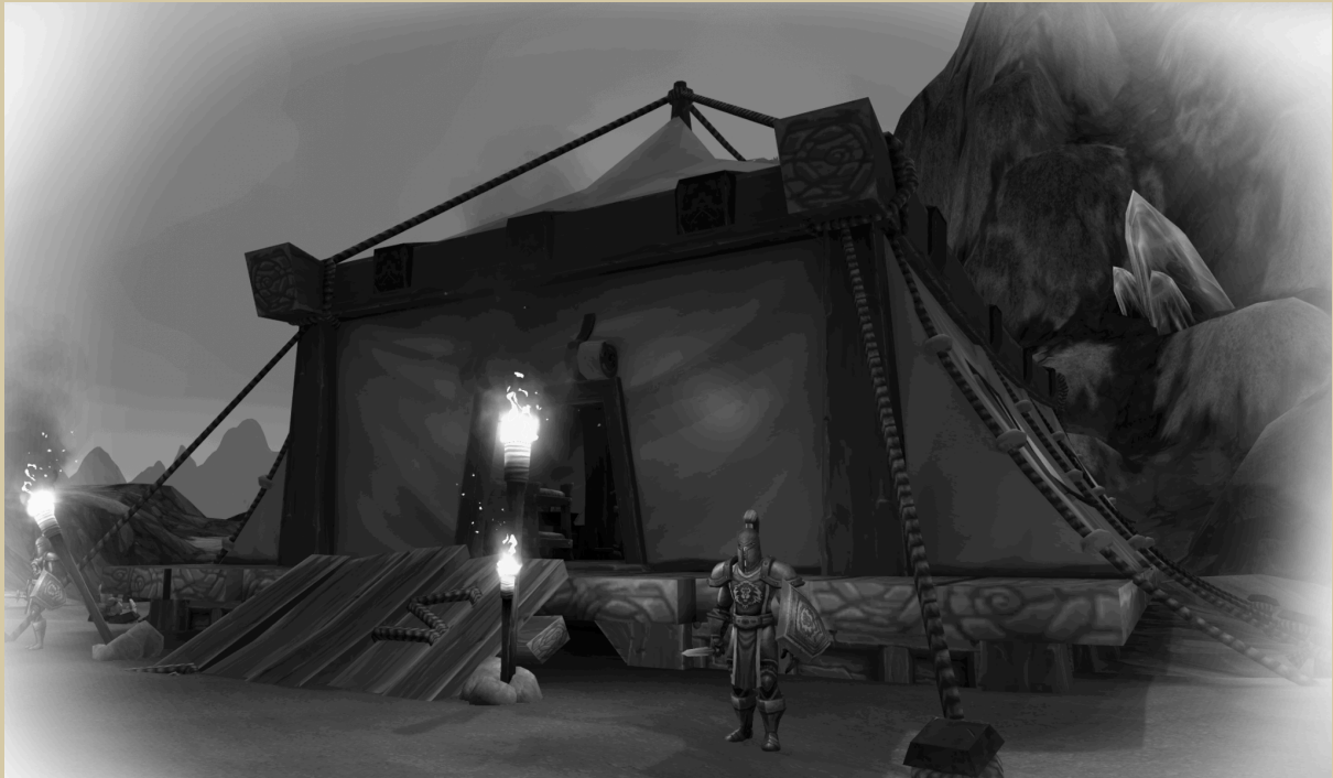
Alliance Tent at Staghelm Point

During the Fourth War, Silithus was Horde Territory, but now it seems to be neutral ground, as the Cenarion Circle and Earthen Ring hold vigil over the wound.