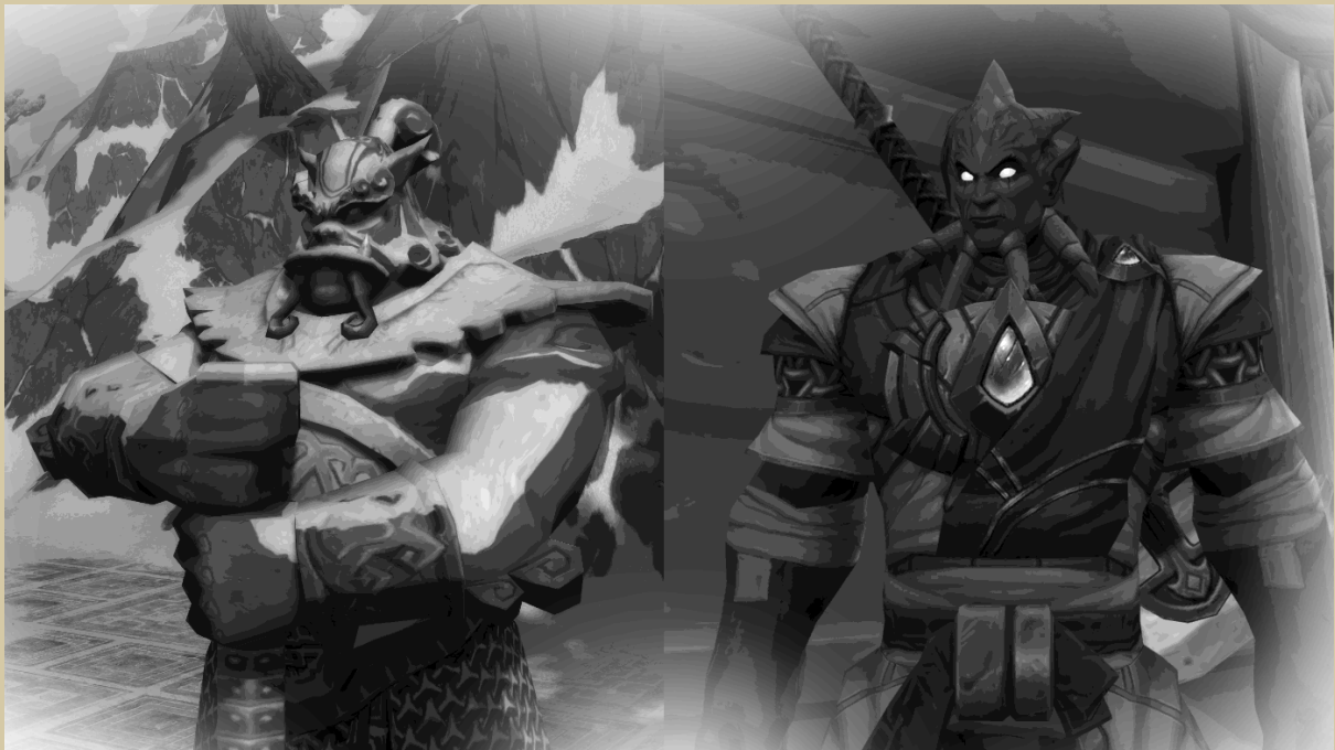
A Comparison of a Mogu Depiction (Left), and a Draenei Citizen (right).

Long have we known of life beyond the Stars. But little did we know that Alien life has been here, on Azeroth, long, long before the Orcs first came to this World! Fear not, dear reader, for I bring you proof of this cataclysmic claim!