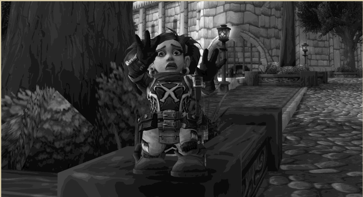
A gnome Photographed at a planter. They seem to flock to these structures regularly.

Gnomes. Just another peoples of the Alliance, one would say, no? Yet, remarkably, we have discovered evidence that might actually prove that there is more to them than meets the eye- and that we may have been fooled all along.